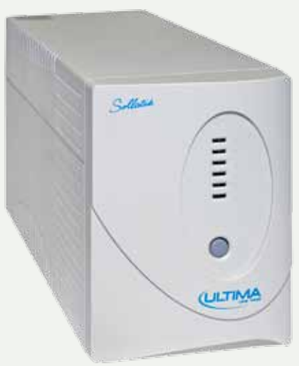
Ultima UPS 1000 / 1400 / 2000

Ultima's Cold Start feature lets you power up your Ultima even in the midst of a power cut. If the Ultima has enough battery power, it can be powered on and will remain on until the battery power is depleted. This way, in case of an emergency you will be able to use your PC even if there is a power cut.