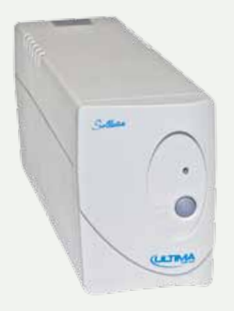
Ultima UPS 400 / 600 / 800