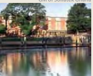
The venue - the Runnymede Hotel