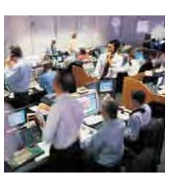
...and large business organisations