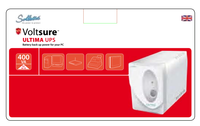
Front face of the newly branded Voltsure packaging