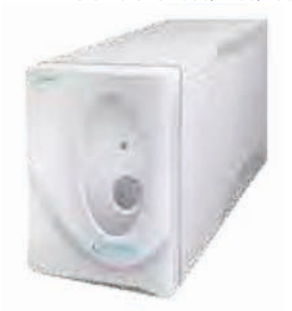
Ultima UPS 400/600/800