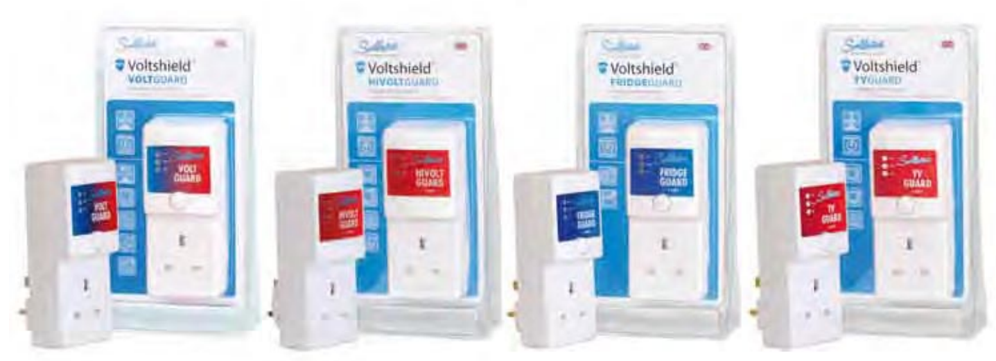
New blister style packaging showing the Voltshield branding

This move by Sollatek strengthens and reinforces status of the range which, with its back-up, reliable quality and 2 year warranty, leads the market.