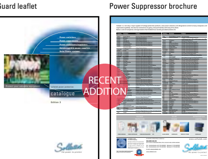
SVS brochure (available shortly)