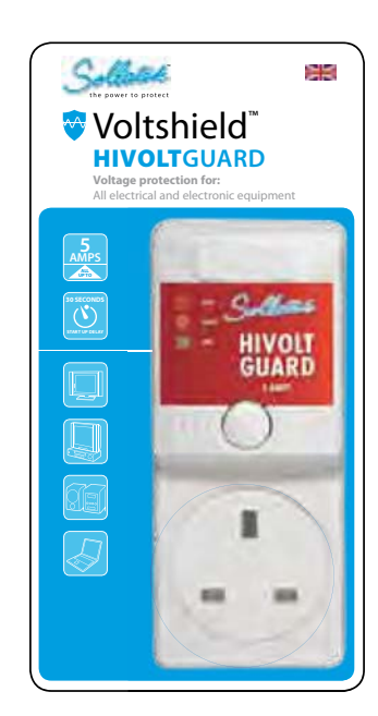
Front faces of the newly branded Voltsafe and Voltshield packaging