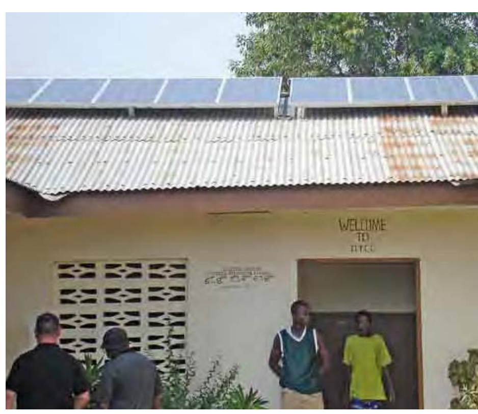
1Kw solar generator - Dolo Town community clinic

This important new initiative is set to help shape the nation's infrastructure, greatly enhancing the lives of the Liberian people. This is a role in which Sollatek managers and engineers are very adept, with the right technology portfolio and the training to deliver support at local level.