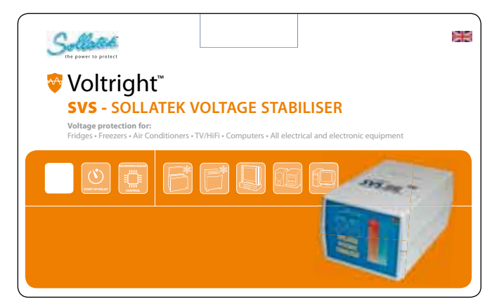
Front face of the newly branded Voltright packaging

This move by Sollatek strengthens and reinforces status of the range which, with its back-up, reliable quality and 2 year warranty, leads the market.