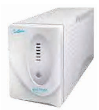
Ultima UPS 1000/1400/2000