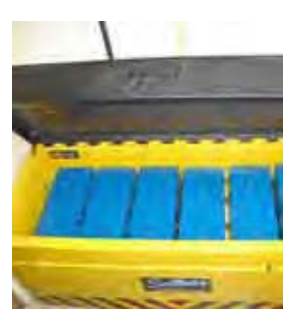
VRLA gel battery