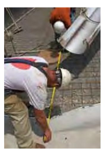
Reinforced concrete foundations make for a stable platform