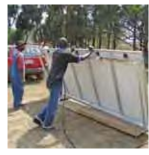
Sollatek\ trained\ in stallers