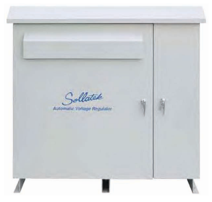
External and internal view of a Sollatek Outdoor Isolating AVR