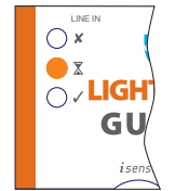
② Yellow LED = wait