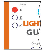
① Red LED = no output

9. You can adjust the iSense™ dial to suit your desired protection level. Refer to the iSense™ function description opposite.