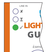
③ Green LED = full output