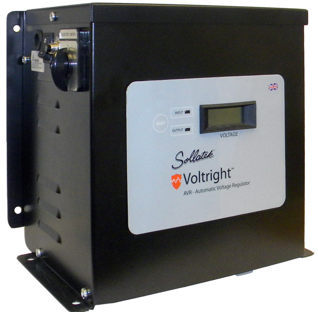
AVRXX-CMPRW (Wall mount, metal casing)